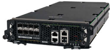
VIPRION 2100 Blade