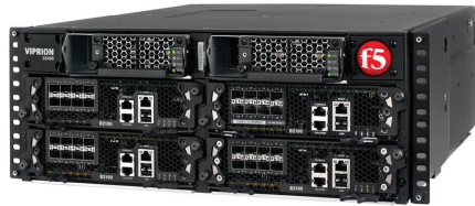
VIPRION 2400 Chassis