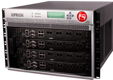
VIPRION 4400 Chassis

Each VIPRION system consists of a chassis and one to four blades.