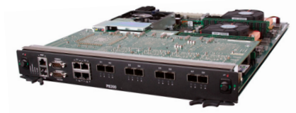
VIPRION 4200 Blade