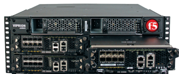
VIPRION 2400 Chassis

VIPRION blades can be added or removed without disruption. For more processing power, simply add a blade. It starts processing traffic automatically. In a VIPRION system with multiple blades, you can remove a blade and the others instantly take over the processing load.