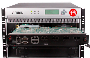
VIPRION 4400 Chassis